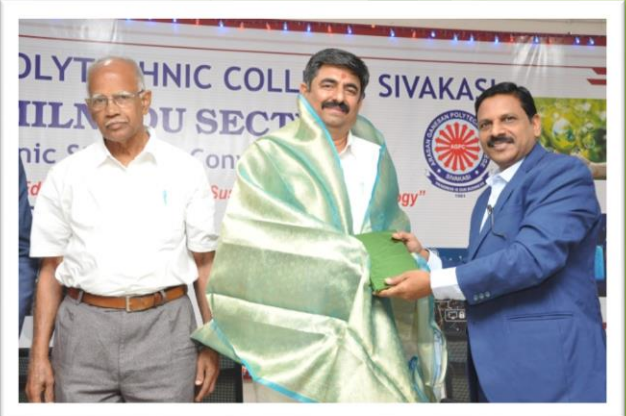
Honoring the ISTE Dignitaries